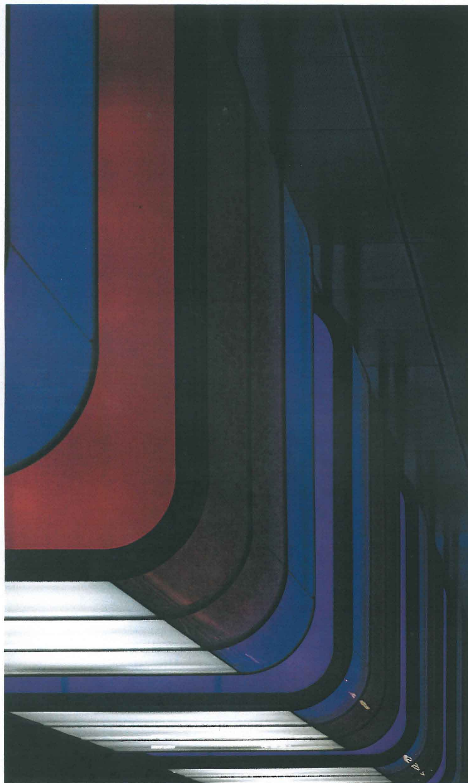
Left The container-like fixtures offer an impressive contrast to the traditional platform, the coloured strips running in parallel to the concrete, offering an original contrast.